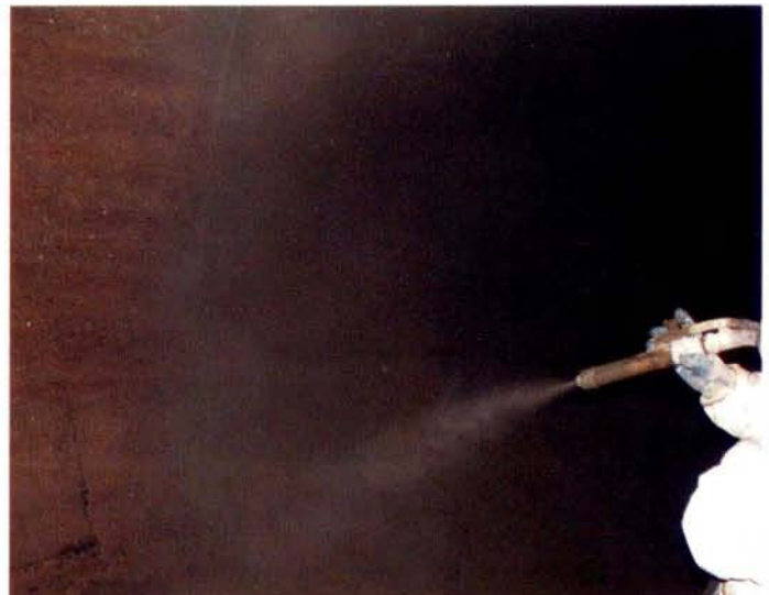
Figure 3: Spray-application of the slurry.