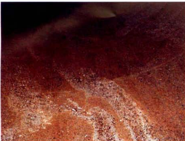
Figure 1: Tunnel surface after the cleaning operation and before the treatment.