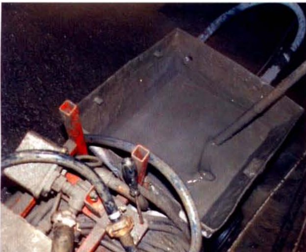
Figure 2: Mixed powder of crystalline product ready to apply in the spray machine tank.